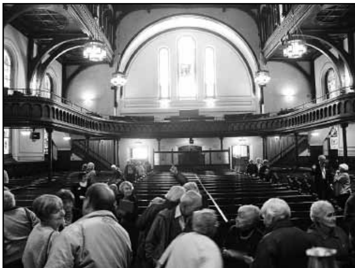
VISITING THE OLD STONE CHURCH

A special thanks to the folks at Hamlet, who kindly provided the use of their nice bus and their pleasant driver. And we even did some singing together on the way home. Our Program Committee did a fine planning job for this interesting and educational trip!