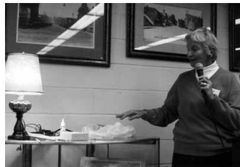
Members and their hobbies.