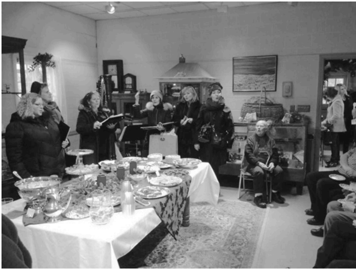
Singing Carols at the Open House