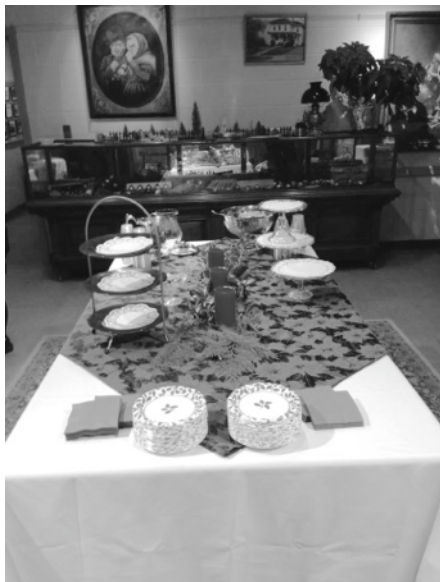
The Museum beautifully decorated for the Victorian Open House