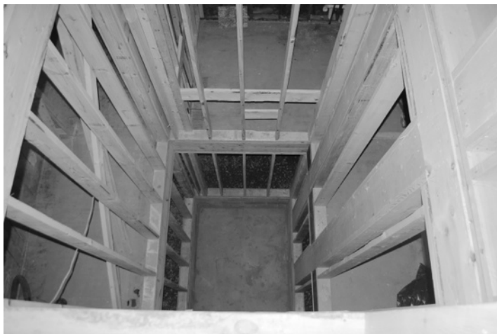
Looking down the elevator shaft

The deconstruction of the building is almost complete and the framing for the interior restoration is well underway. The rough plumbing for the bathrooms has been inspected and approved, as has the framing for the elevator shaft.