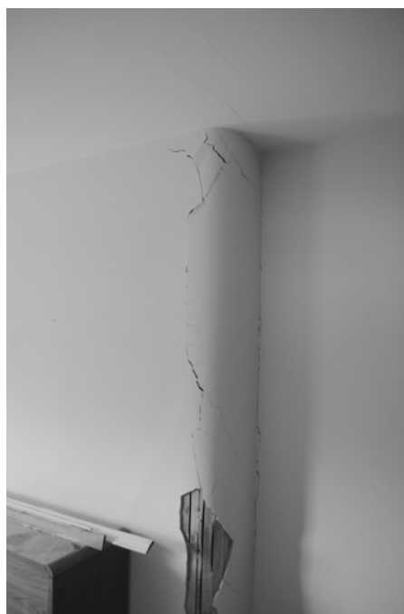
Damaged caused to the plaster walls when the floors were leveled.

Once the new beams were in and leveled, we began jacking up the floors to even them out. As expected, jacking up the floors had the consequence of cracking and breaking some of the plaster upstairs.