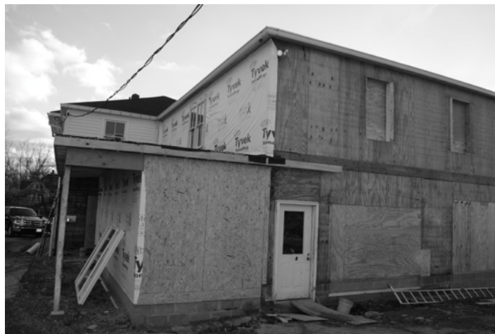
rear of building with new addition

preparations are underway for the new siding to be attached.