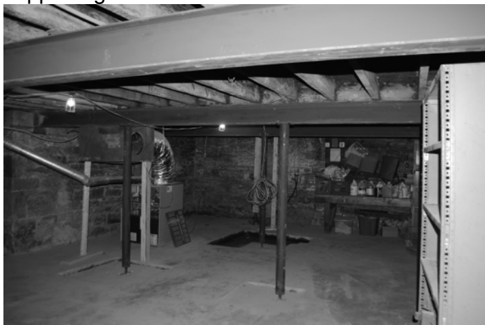
New steel beams in the basement

We have put a total of seven steel beams in the building. Four beams were necessary in the basement, with three additional beams supporting the 2nd floor.